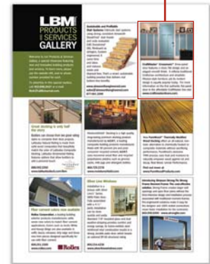
2 PAGE SPREAD (16.5" X 10.875")